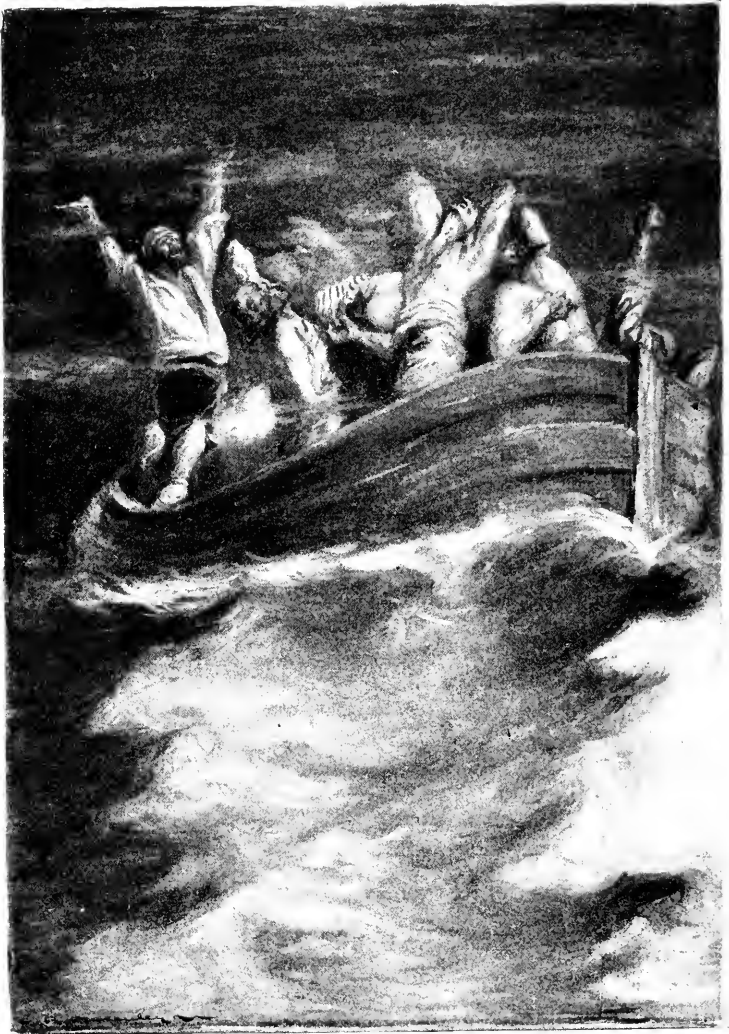
Full of men who writhed and tumbled over each other . . .